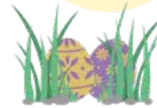
Yummy Easter eggs