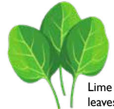
Lime green leaves