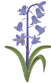
Carpets of dancing bluebells